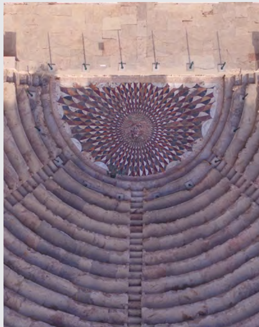
Kibyra Ancient City