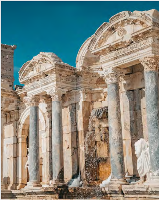
Sagalassos Ancient City

History buffs will find themselves delighted with the rich ancient sites around Burdur City. Sagalassos is a magnificent ancient city about 30 kilometers to the northwest. Its well-preserved ruins and impressive mountain views make it an archaeological treasure trove. Another important ancient city, Kibyra, is about 40 kilometers south of Burdur. Its grand amphitheater and impressive ruins of ancient Anatolian civilization offer students a fascinating insight into the region's fascinating history. Both Sagalassos and Kibyra offer students the opportunity to explore the fascinating history of the region.