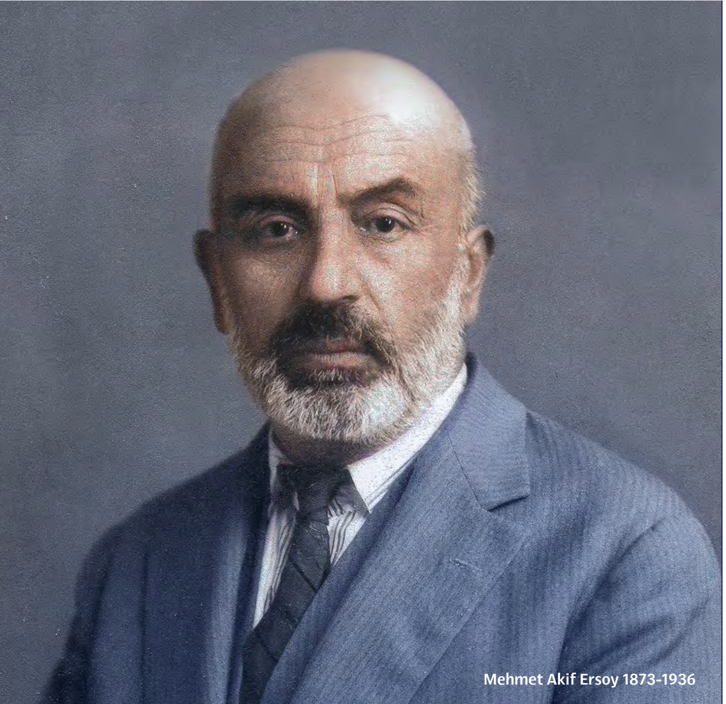
Mehmet Akif Ersoy 1873-1936